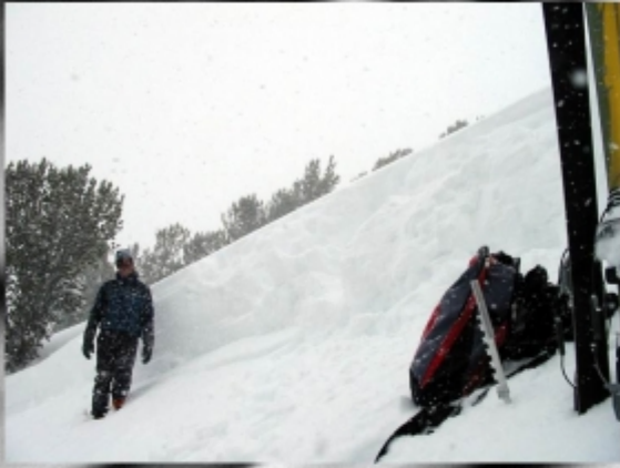
This is an avalanche triggered by two experienced avalanche forecasters while digging a snow pit. Conducting stability tests in avalanche terrain is inherently dangerous since it exposes the observer to the potential of being caught in an avalanche.